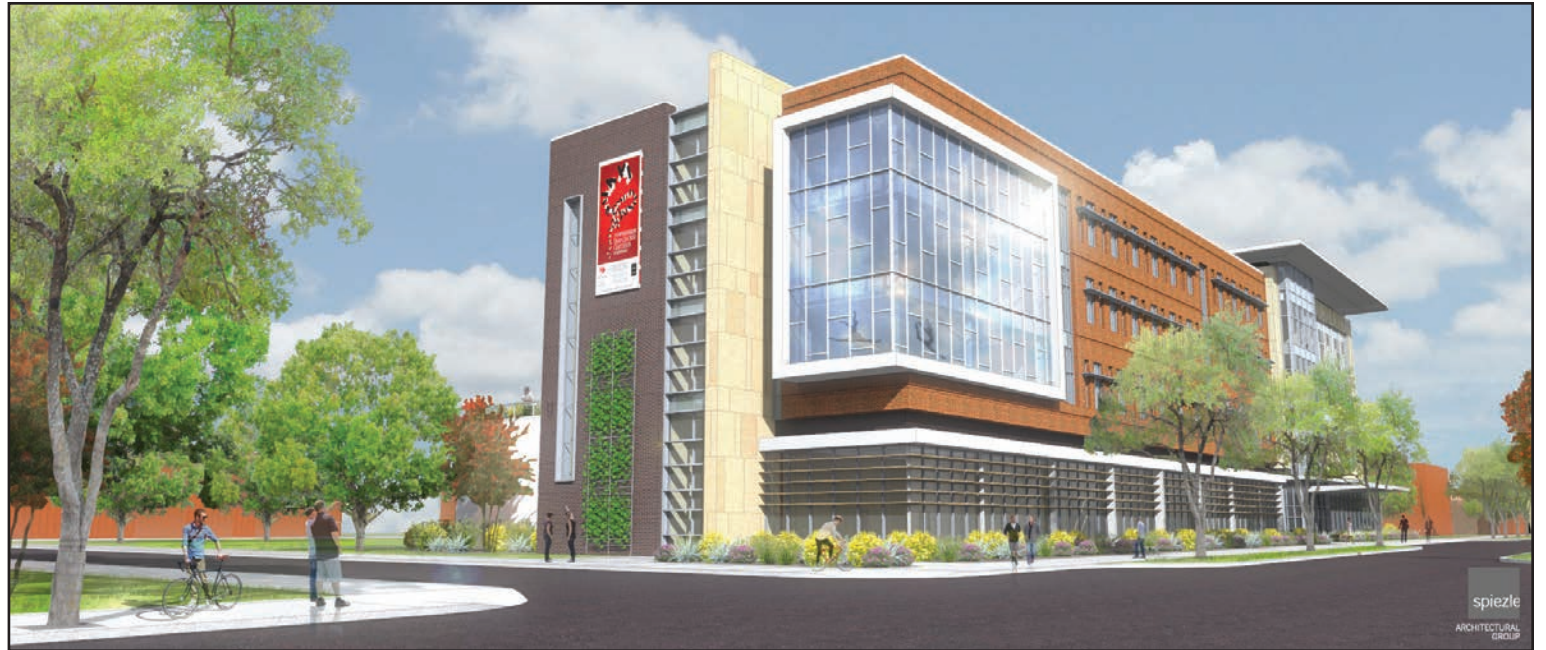
The future Academic Building: West Campus (architect's rendition).

"We're just focusing [on] the first phase [of] two projects [which are] a 400-bed student housing and an academic build-