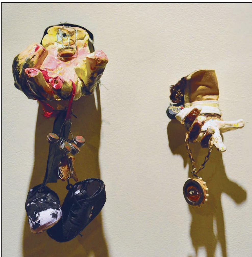
Heavy by Nyugen E. Smit

A piece in the center of the room follows a repeated theme of a native islander dressed in judge's clothes and a traditional white wig. Mr. Judge Man is complete with a gavel and a sign beneath the box he is perched on that reads "Kneel"; it's made of latex, wood, gesso, wire, cork and acrylic. It is a must see of the "Thy Kingdom Come" series. You can check it out until March 6.