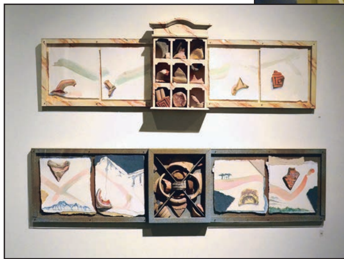
The First Snow 8/20 by Mary Ellen Campbell

After studying with some of the leading book artists of the time, Campbell acquired a technical ability to create aesthetically pleasing books by using different materials and binding techniques. Campbell's books are constructed from various means such as floppy discs, soda cans, sticks, leaves, rocks, rope, and vine. She also integrates her poetry, watercolor paintings, and travel journals into her books.