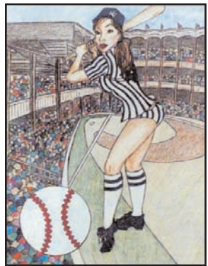
Batter Up — Suehaydee Rosa