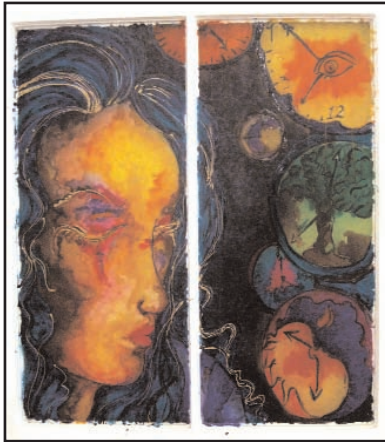
Circles of Time — Sidra Hassan